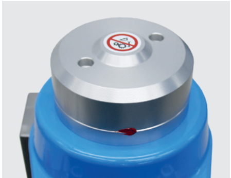
Closed and sealed module with bar-agturn®