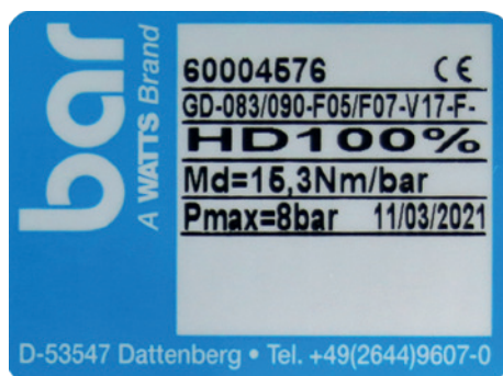
Name plate GD/GS

The name plate is fixed on the pneumatic actuator.